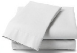
Plain Cotton Bedsheets