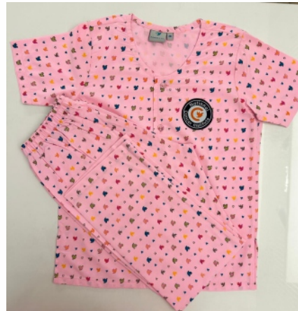
Kids Patient Dress